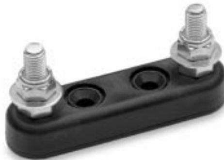
Fuse Block No. 4164